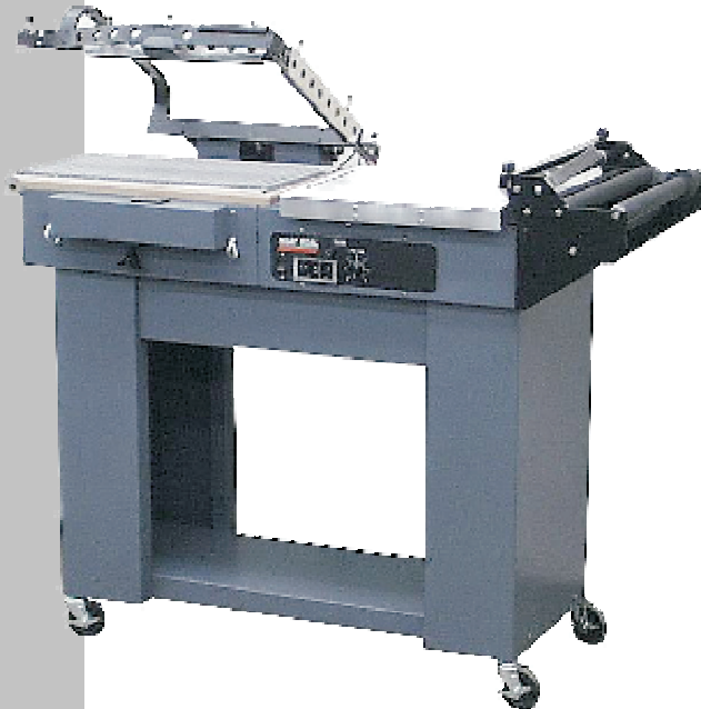
Shown As: HS-1520D With Optional Perforating Roller

PROVIDES STRONG, CONSISTENT SEALS WITH ALL TYPES OF CENTERFOLDED FILM