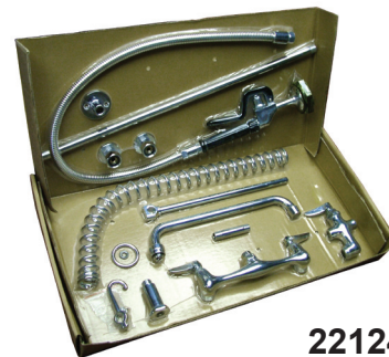
22124 Wall mounted, with faucet.