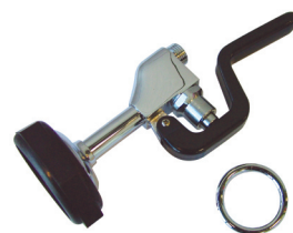
23518 - Pre-rinse spray valve assembly