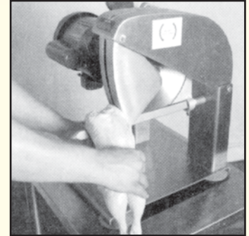
Bird poised to remove wings through natural knuckle point of dissection.