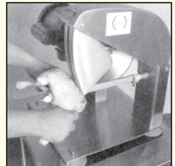
Thigh and drumstick right side, poised for removal.