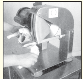
Right drumstick and thigh removal.