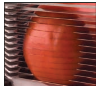
Blades are razor-sharp stainless steel for a smooth, precise cut.

Microban® is a registered trademark of Microban International, Ltd.