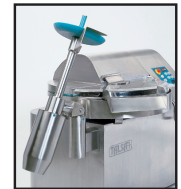
Optional motorized unloader