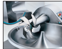
Standard removable 6 and 3-knife head.