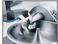
Standard removable 6 and 3-knife head.