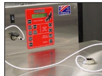
Cookshack Digital IQ3 Controller