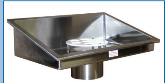
STAINLESS STEEL COVERED FEED TRAY