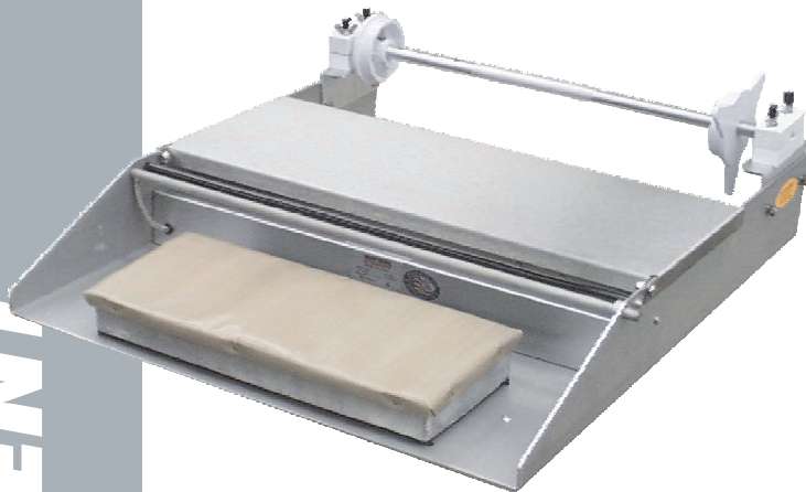
Shown As: Model 625-A w/6" by 15" Hot Plate