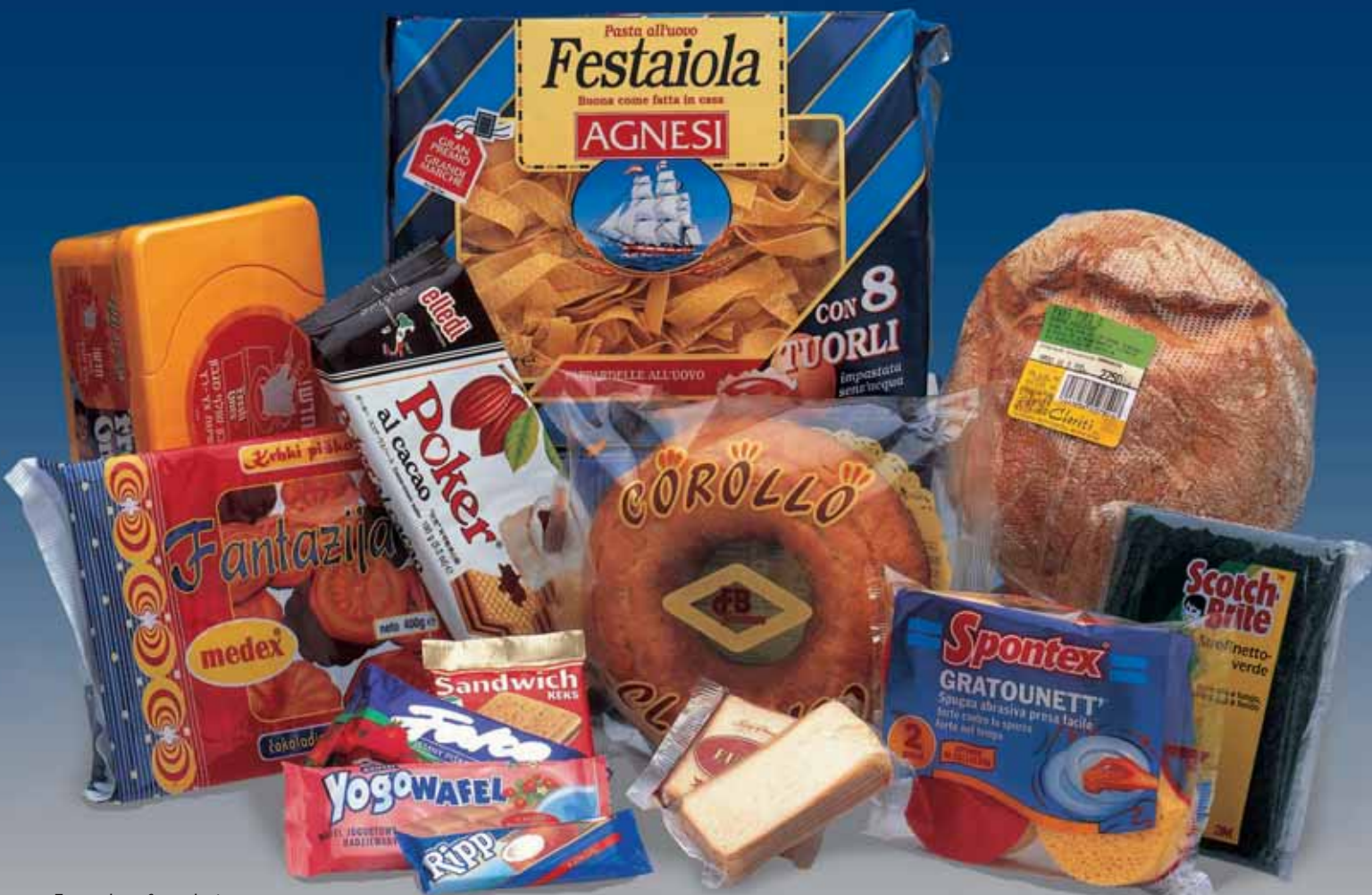
Examples of products

Horizontal flow wrap packaging machine which produces closed wrappers with three sealed edges from a roll of heat-sealable wrapping material.