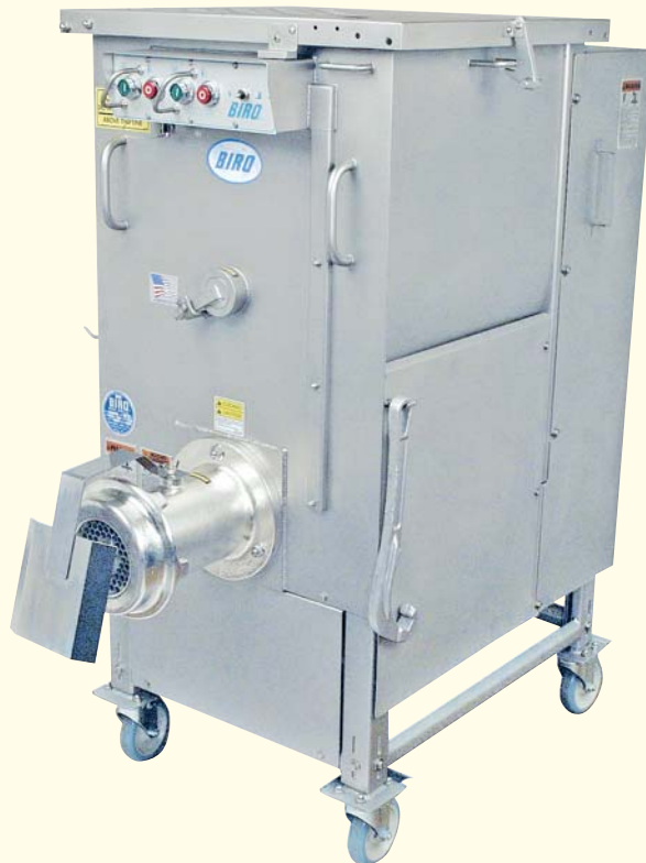
STANDARD, NO INLET

The Biro Model AFMG-52 is the ideal workhorse mixer grinder for large supermarket meat rooms and medium sized processors and HRI plants. Its 7.5 hp (5.6 kW) motor (or optional 10 hp, 7.5 kW motor) provide an output of up to 100 lbs. (45.5 kg) per minute to give you the productivity you need. The separate auger and mixer motors means there is no clutch to wear out or break, which means much lower maintenance costs and higher profits. The heavy duty roller chain auger drive with tapered roller bearings is separate from the mixer drive, to give maximum power to the auger and more efficiency. The heavy duty stainless steel 200 lb. (90.9 kg) hopper and frame resist corrosion and damage, even in an environment of harsh cleaners. Your mixer grinder lasts longer and gives you more return on your investment. Power, durability, and low maintenance help the Biro Model AFMG-52 Mixer Grinder work harder so you don't have to.