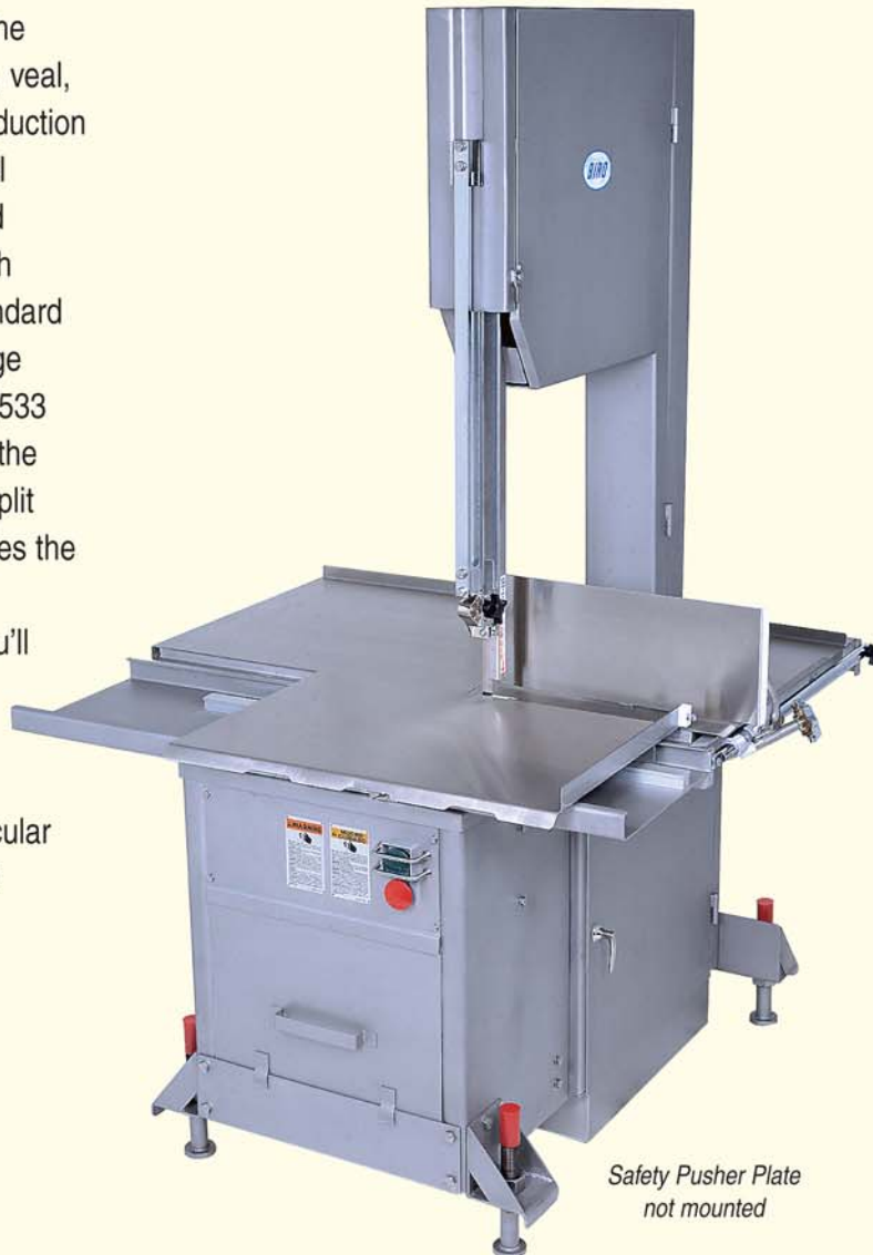
Safety Pusher Plate not mounted

The 5 hp (3 Kw) motor provides all the power you need to break pork, lamb, veal, or beef all day in a high volume production operation. Heavy duty, stainless steel construction helps the Model 55 hold up under the harshest conditions with minimum maintenance. With the standard front moving carriage and meat gauge plate and 20" H (508 mm) by 21" D (533 mm) cutting clearance, you can use the same saw to produce retail cuts or split loins and break quarters, which makes the Model 55 unmatched for versatility. Superior Biro engineering means you'll have a saw that's built to last. Over the life of the saw you'll get more for your money. As with all Biro products, if you need a particular modification to fit your application let us know. We'll try to build it for you - something only Biro does.