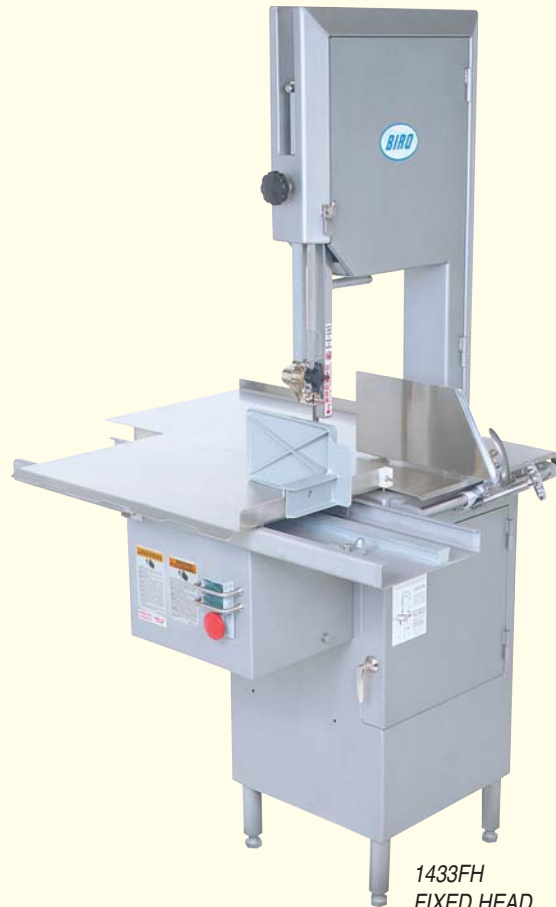
1433FH FIXED HEAD