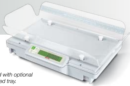
Pictured with optional four-sided tray.