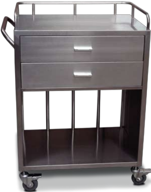
Optional stainless steel cart.