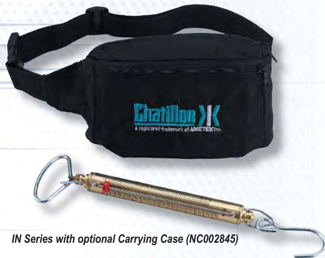
IN Series with optional Carrying Case (NC002845)