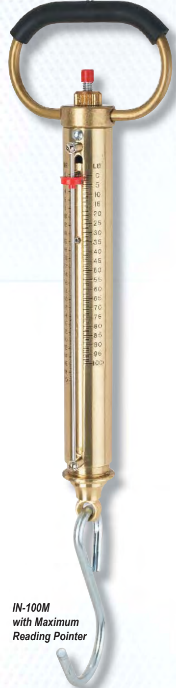
IN-100M with Maximum Reading Pointer