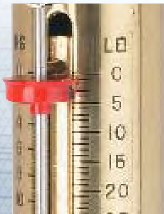
Maximum Reading Pointer