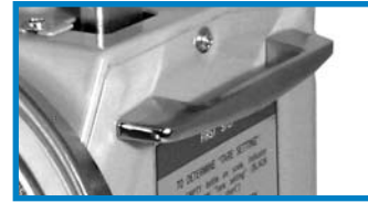
BC-10 with carrying handle